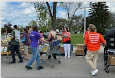
2024 Community Resource Fair

Identified Gap: A shortage of affordable housing options for individuals and families struggling with homelessness remains a significant barrier.